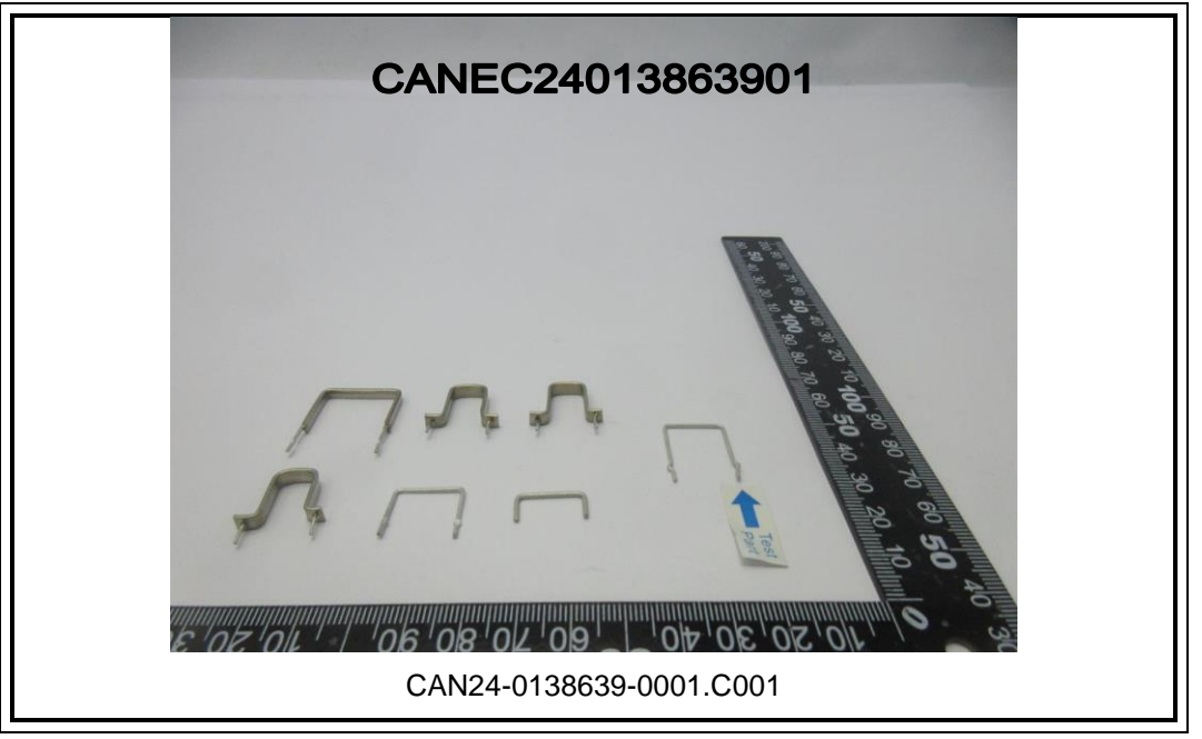
SGS authenticate the photo on original report only *** End of Report ***